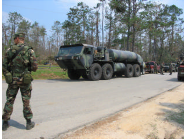
(10 Sep. 05) HHB 38th DivArty and HHB 2-138 Service Battery soldiers guard a fuel tanker in Kiln, Mississippi during a mission to refuel workers.